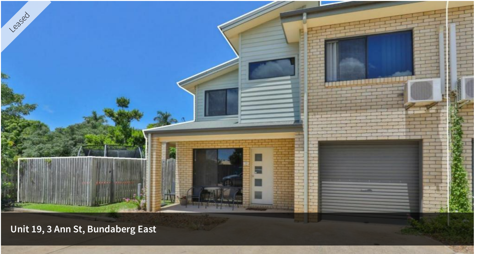
Unit 19, 3 Ann St, Bundaberg East