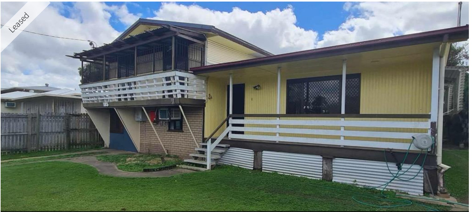
183 High St, Berserker